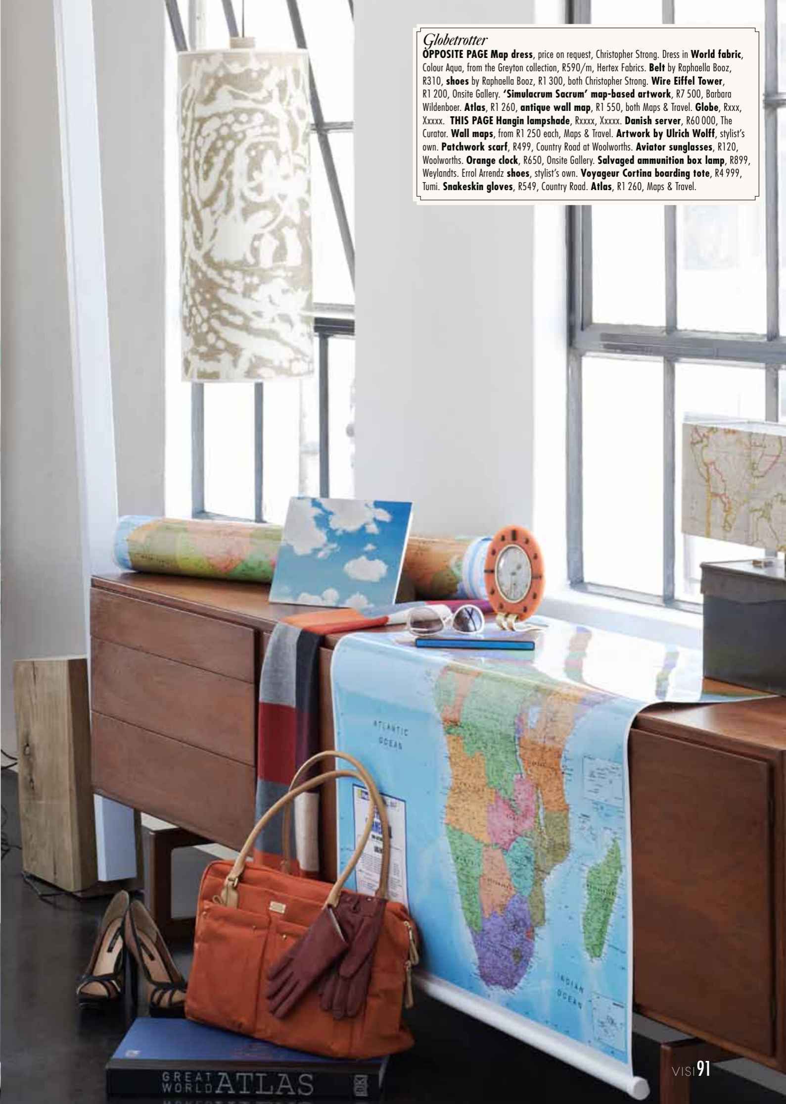
Globetrotter OPPOSITE PAGE Map dress, price on request, Christopher Strong. Dress in World fabric , Colour Aqua, from the Greyton collection, R590/m, Hertext Fabrics. Belt by Raphaella Booz, R310, shoes by Raphaella Booz, R1 300, both Christopher Strong. Wire Eiffel Tower , R1 200, Onsite Gallery. 'Simulacrum Sacrum' map-based artwork, R7 500, Barbara Wildenboer. Atlas , R1 260, antique wall map , R1 550, both Maps & Travel. Globe , Rxxx, Xxxxx. THIS PAGE Hangin lampshade, Rxxxx, Xxxxx. Danish server , R60 000, The Curator. Wall maps , from R1 250 each, Maps & Travel. Artwork by Ulrich Wolff , stylist's own. Patchwork scarf , R499, Country Road at Woolworths. Aviator sunglasses , R120, Woolworths. Orange clock , R650, Onsite Gallery. Salvaged ammunition box lamp , R899, Weylandts. Errol Arrendz shoes , stylist's own. Voyageur Cortina boarding tote , R4 999, Tumi. Snakeskin gloves , R549, Country Road. Atlas , R1 260, Maps & Travel.